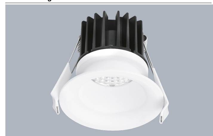
CurveE™ 10W Baffled Dimmable IP44 LED Downlight