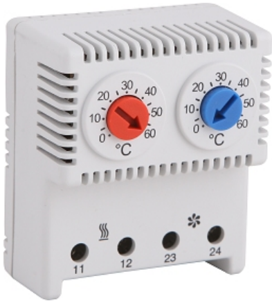
DETVHT Thermostat Wiring Diagram

Double Thermostat 0 to 60 degree for heating and cooling applications