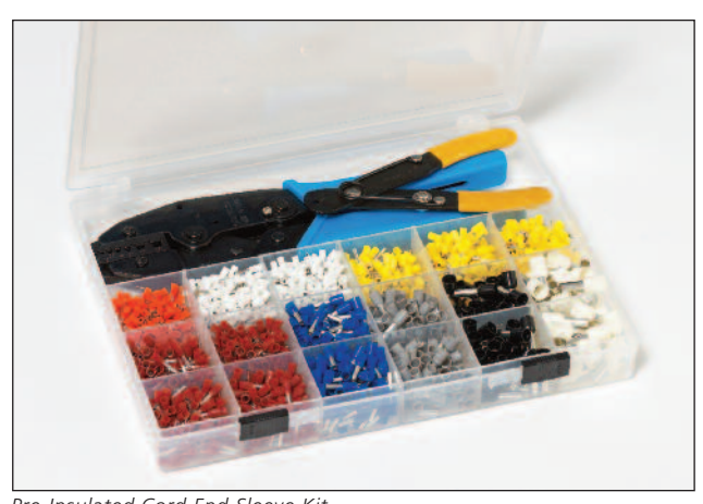
Pre-Insulated Cord End Sleeve Kit.