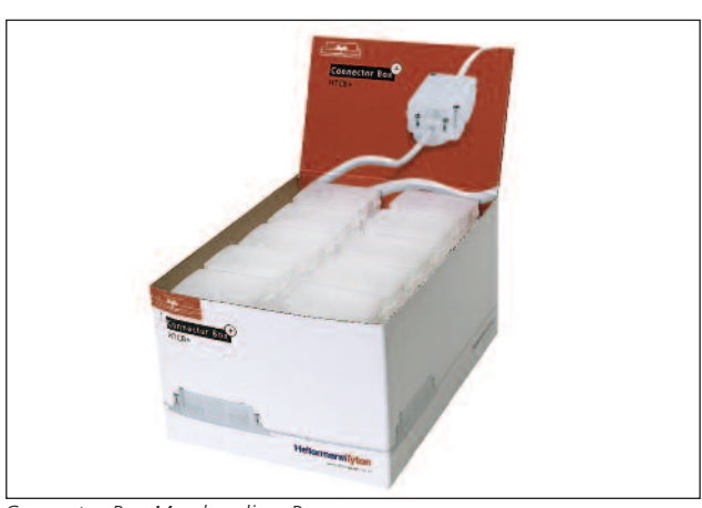
Connector Box Merchandiser Box.