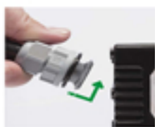
Kwik-Fix Cable Glands M16, M20 & M25