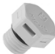
Venting Elements M12 & M20