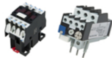
Contactors/ Thermal Overloads