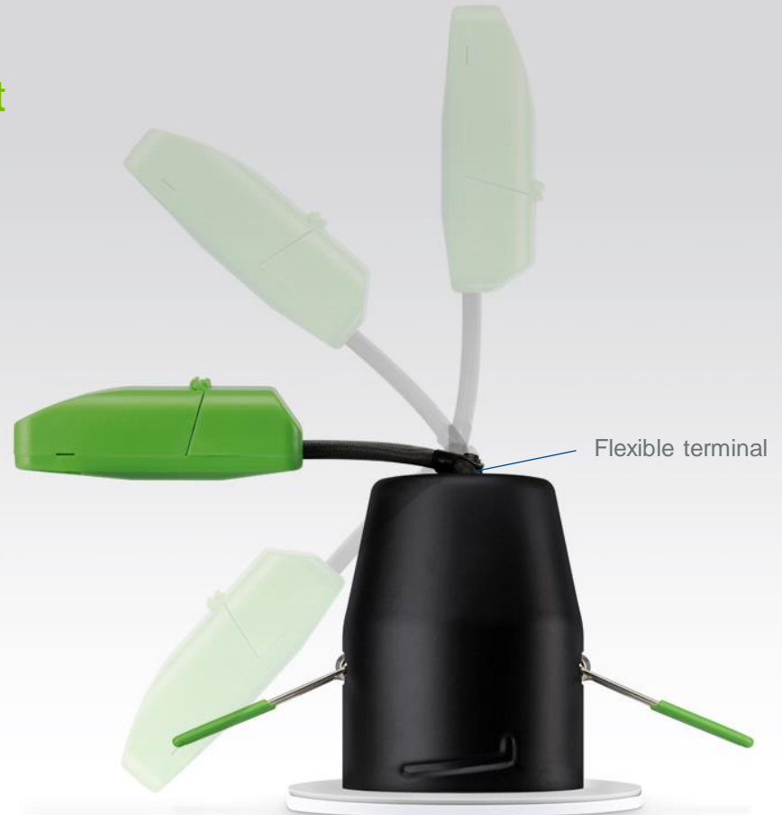
Fireguard® Next Generation