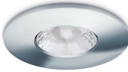
Fireguard® Next Generation IP65