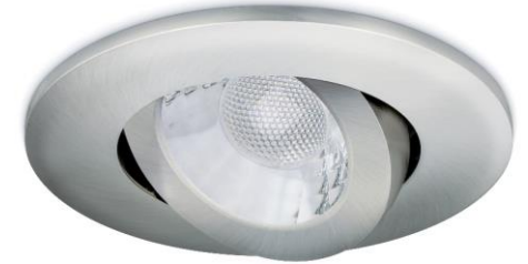
Fireguard® Next Generation Tilt