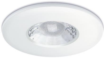
Fireguard® Next Generation IP20